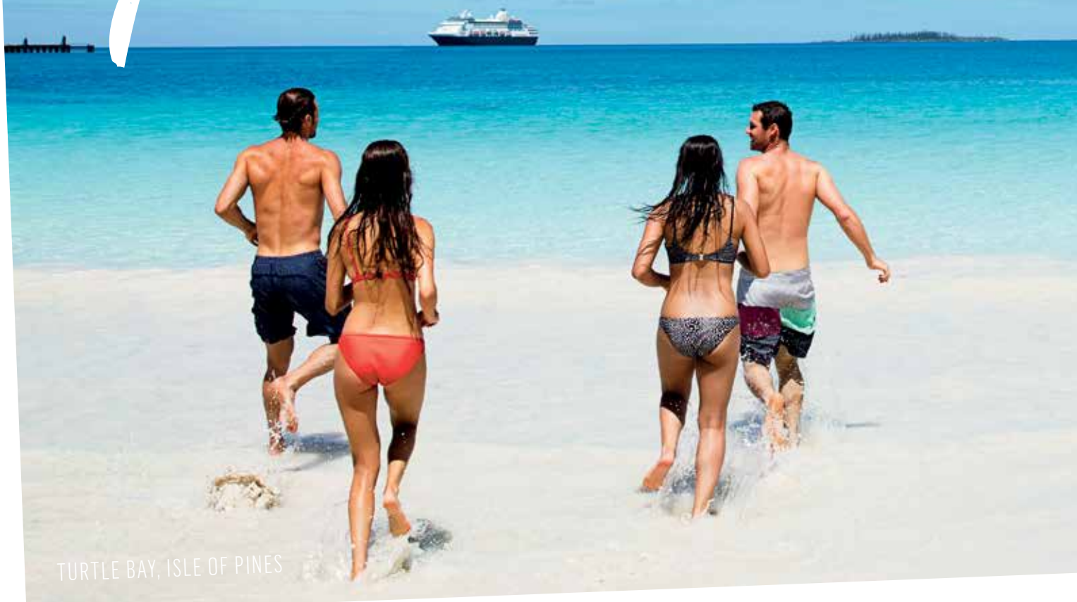
TURTLE BAY, ISLE OF PINES