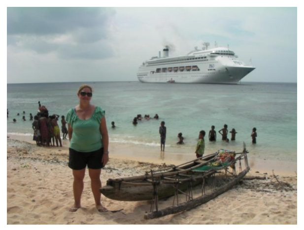
Back at anchor at a safe distance!