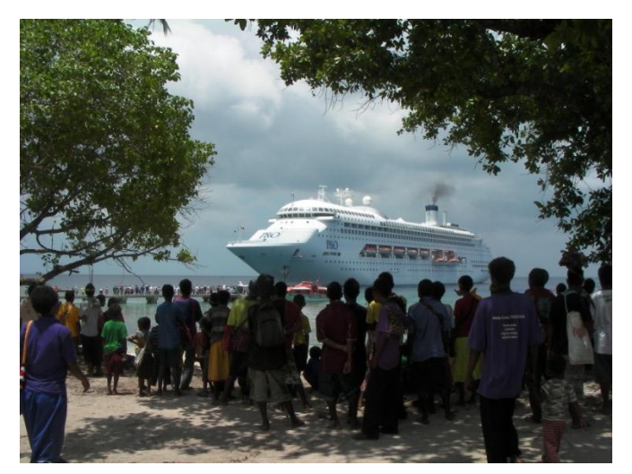
We almost became locals!